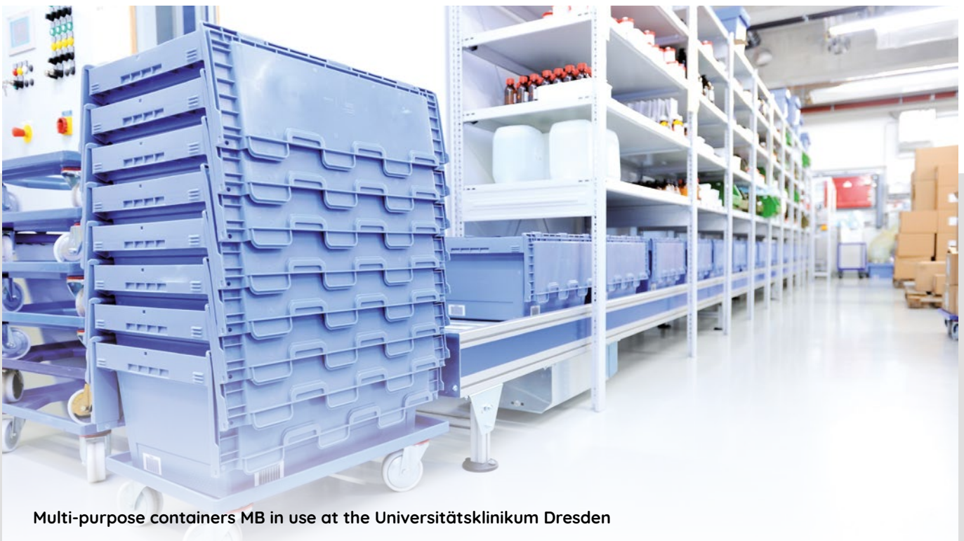
Multi-purpose containers MB in use at the Universitätsklinikum Dresden