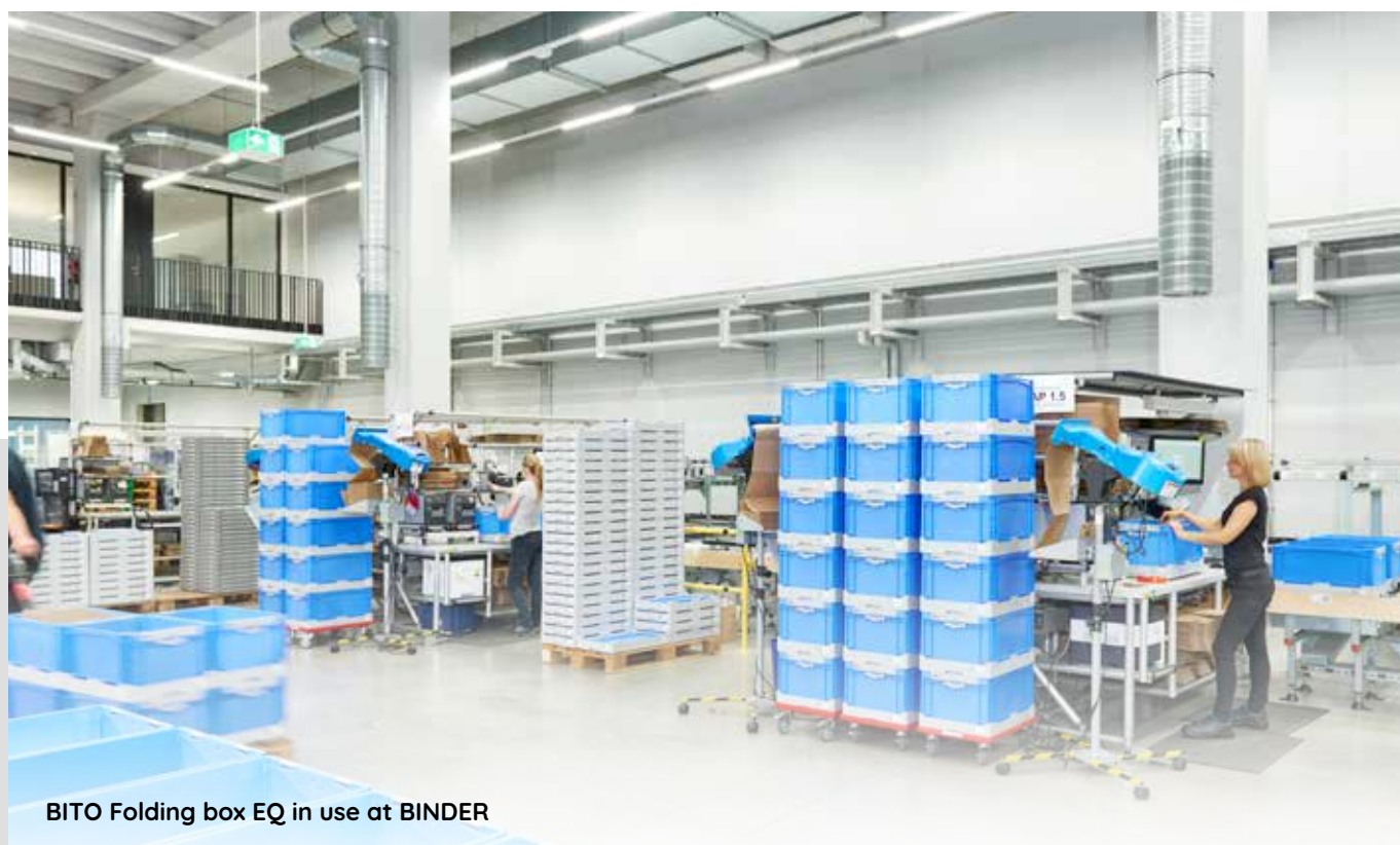
BITO Folding box EQ in use at BINDER

They are space-saving, versatile and can even be used in automated warehouses. Our competent in-house experts will be pleased to provide further information. Contact us today!