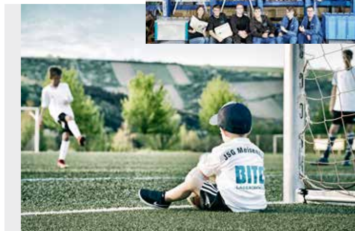
Every year, BITO offers a variety of attractive vocational qualification opportunities. We also sponsor sports to promote physical activity among children and young people.

With the establishment of the Bittmann Foundation we have made a clear commitment to support others and improve the state of the community and the world we live in.