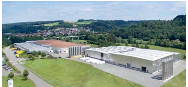
BITO Lauterecken – Plant for plastic bins & containers

By choosing eco-friendly products, we contribute to the protection of the environment and health of everyone involved in the value chain.