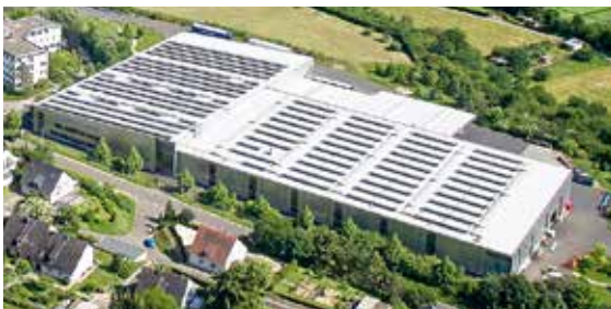
BITO Meisenheim - Photovoltaic panels on plant roof

With the photovoltaic panels currently in operation, we would be able to supply 88 average households (3,000 kWh/a) with electricity or drive an electric car 1.3 million km.