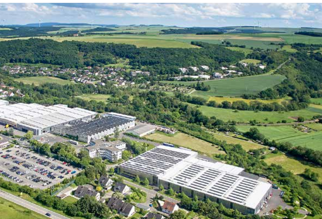
BITO Meisenheim – Headquarters and plant for steel shelving & racking