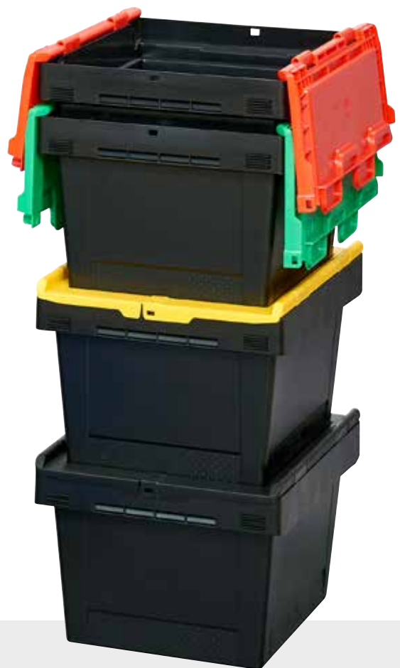
BITO MB ECO – stacks when full, nests when not in use

There is still another advantage: The new MB ECO is a good alternative not only from an ecological, but also from an economic point of view, as it is somewhat cheaper to manufacture and therefore has a lower selling price than the standard MB container.