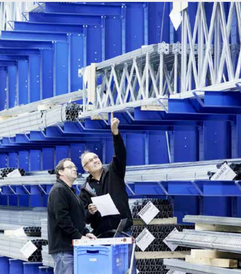
Members of our After Sales Service team on an inspection visit

In order to ensure that our customers do not have to worry about safety, we recommend to conclude a maintenance contract. Adding the fact that measures carried out in good time also increase the service life of a storage installation and help to prevent expensive repairs.