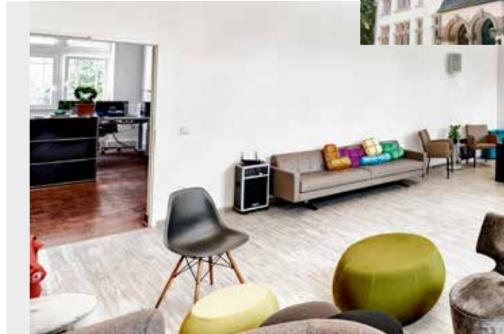
The BITO Campus is fully equipped to provide a stimulating environment for start-ups.

At our headquarters young people can apply for some 20 vocational careers from an apprenticeship to a university degree – opportunities that make BITO an attractive employer for bright minds in our region.