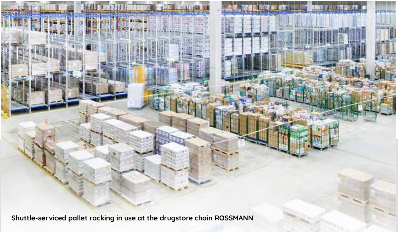
Shuttle-serviced pallet racking in use at the drugstore chain ROSSMANN

The shuttle carts run on rails in the storage lanes, loading and unloading pallets without human intervention. Depending on the inventory management system the carts are transported to their home position at the front or the back of a lane by a standard forklift truck. Pallets can be stored in FIFO as well as in LIFO order and can be used for deep-freeze environments with temperatures as low as -30°C.