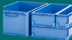
Same height principle