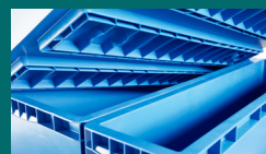
Modular stacking base