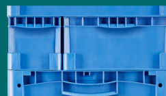
100% volume utilisation