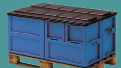
Covers for palletised loads