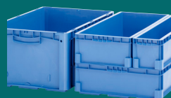
Same height principle