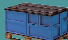
Covers for palletised loads