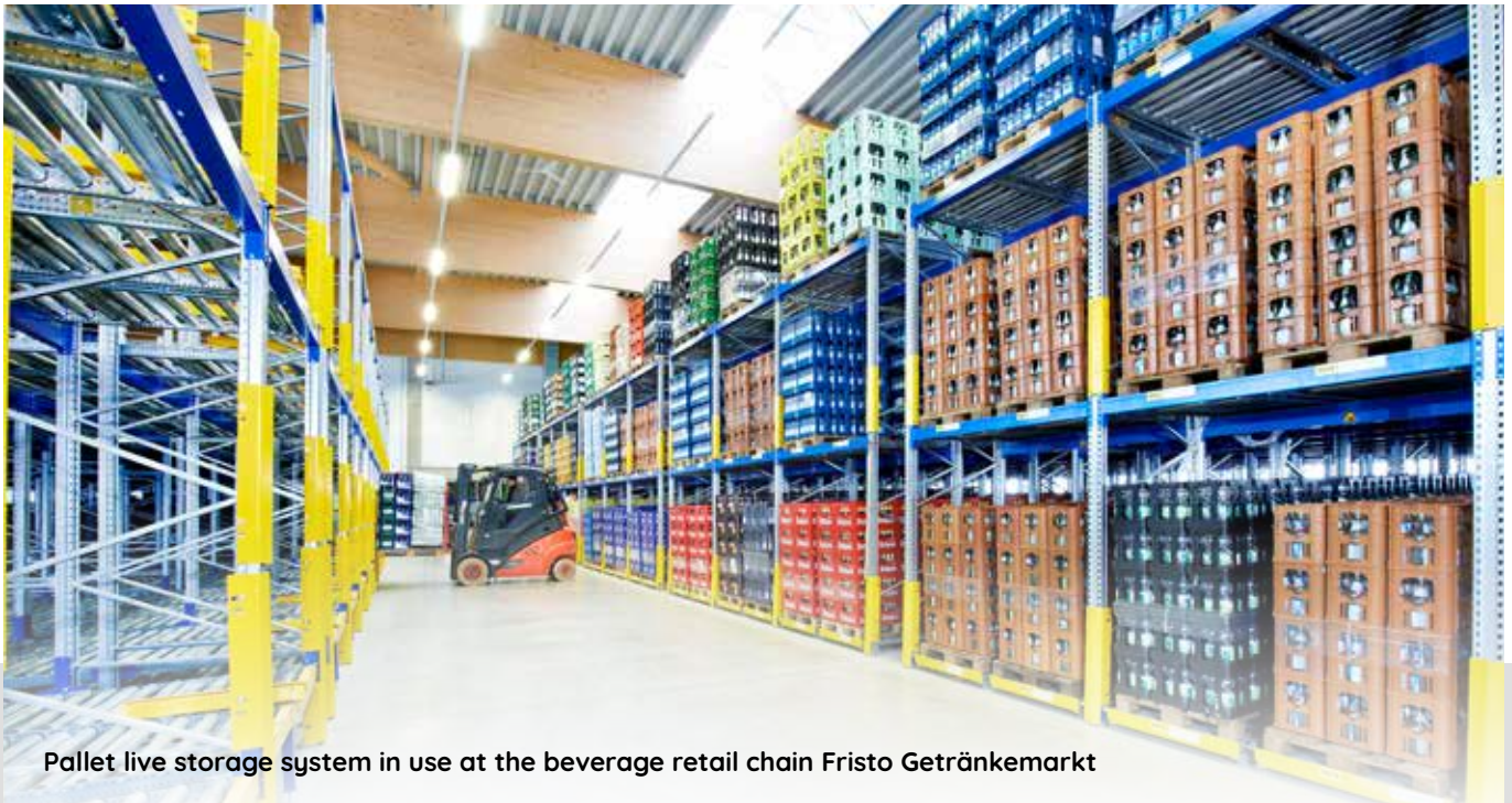
Pallet live storage system in use at the beverage retail chain Fristo Getränkemarkt

Pallet live racking only needs two service aisles located at opposite ends: one aisle is used for loading goods and the other one for order picking, saving up to 60 percent of the storage space needed for static pallet racking.