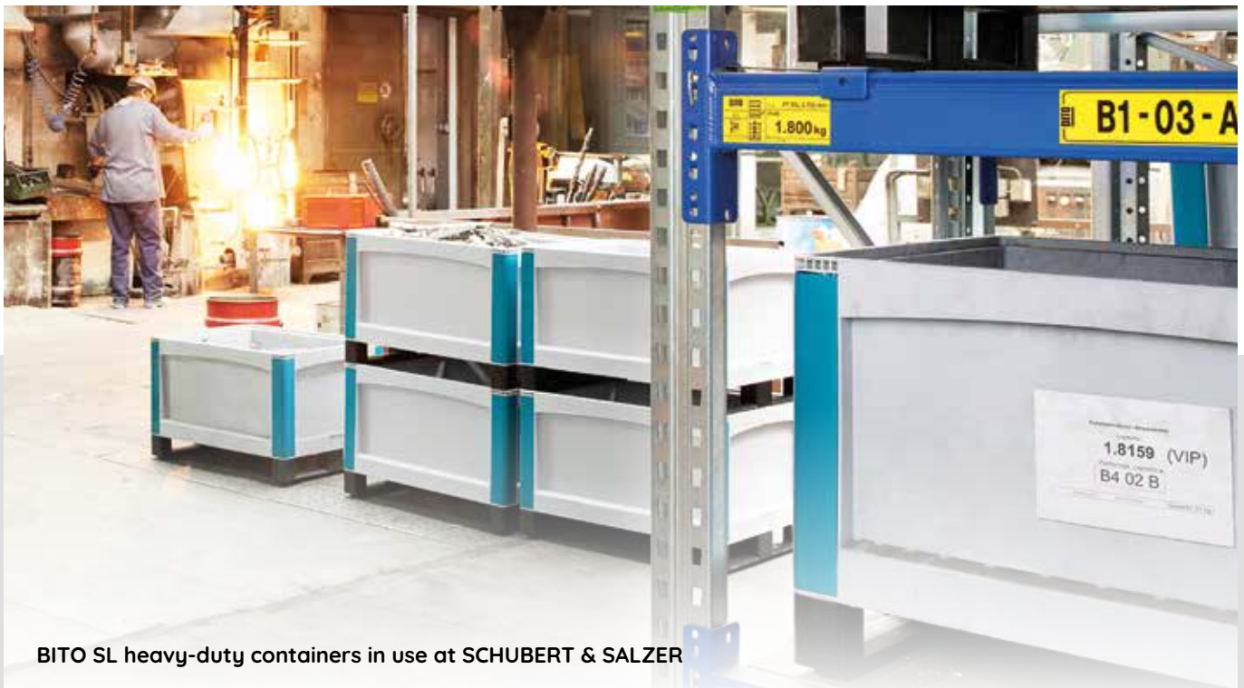
BITO SL heavy-duty containers in use at SCHUBERT & SALZER

In addition to being used for heavy loads, SL heavy-duty containers can also be used wherever clean and dust-free handling and safe transport of sensitive parts are important. The container has been designed to support the most modern production principles and helps to ensure clean production conditions.