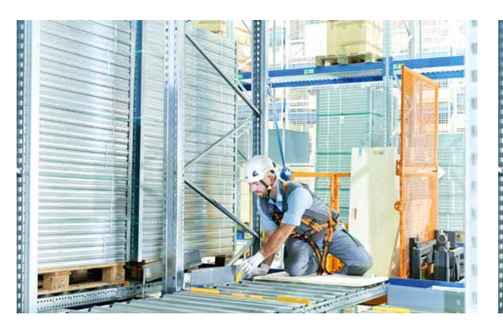
3. Swing activator of the FlowStop load separator to the side and secure it with the holding device.