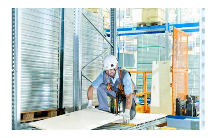
5. Place connecting boards into the lane until you reach the trouble point.