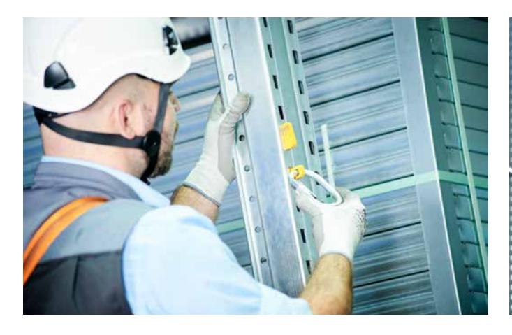
1. Select a safe anchor point for fitting the BITO easyHOOK, lock in the twistlock carabiner.