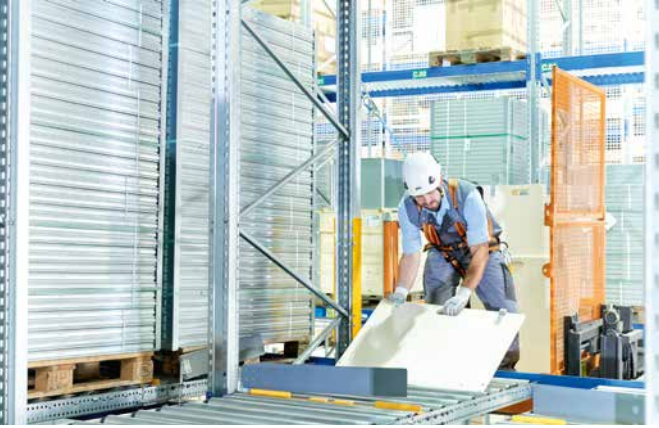
2. Open the door of the maintenance basket and place the starting board into the lane adjacent to the "trouble" lane.