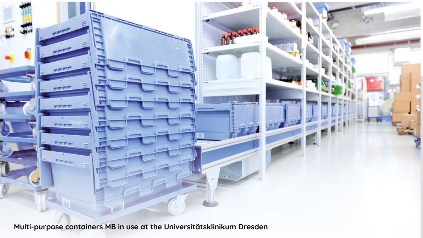
Multi-purpose containers MB in use at the Universitätsklinikum Dresden