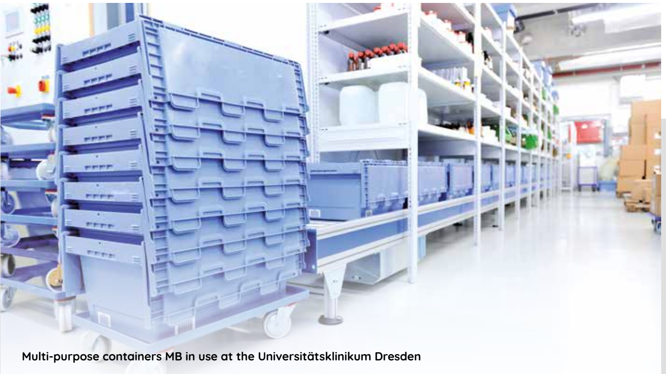
Multi-purpose containers MB in use at the Universitätsklinikum Dresden