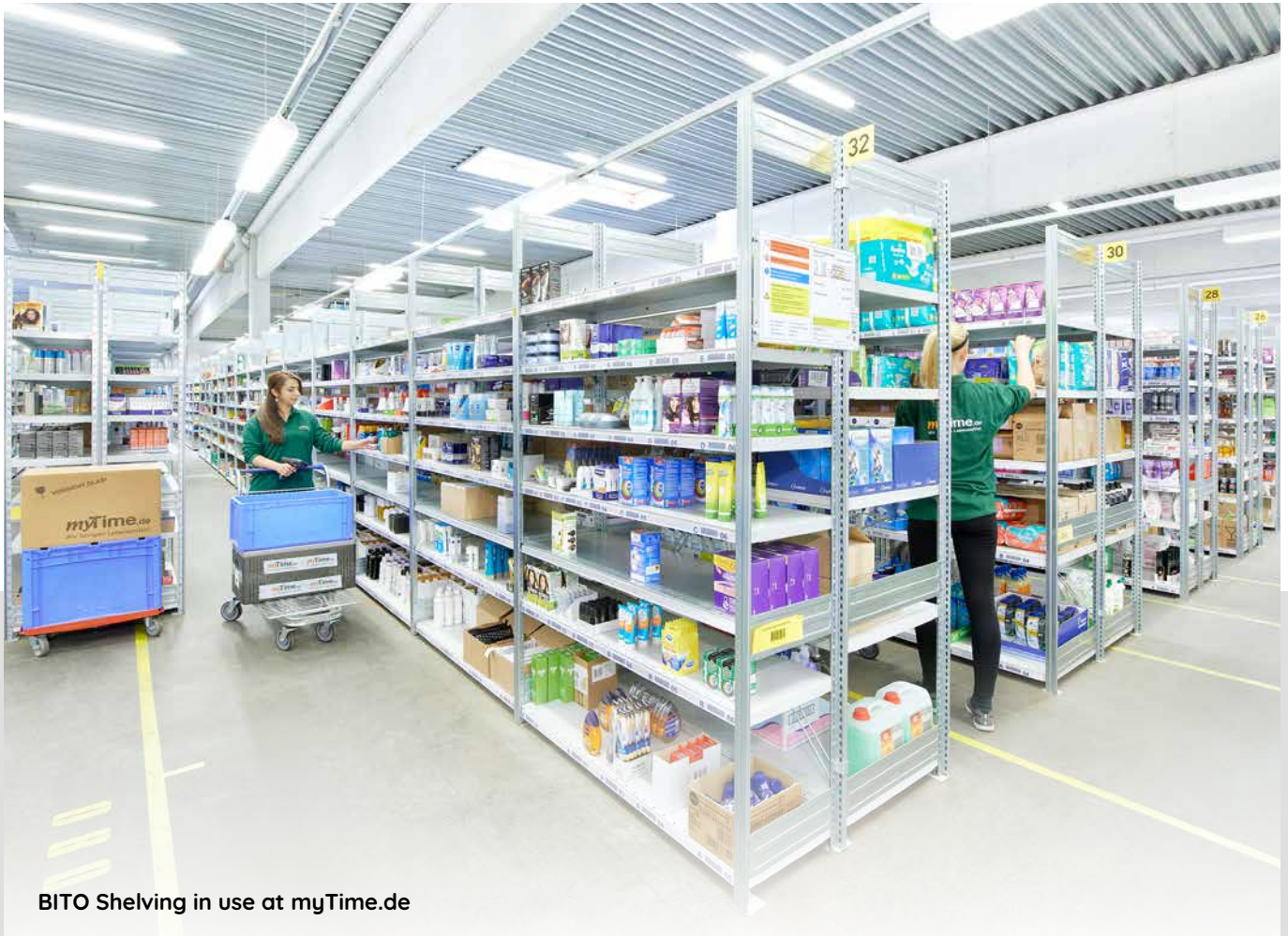
BITO Shelving in use at myTime.de

BITO Shelving meets strict quality standards. It accommodates any kind of product. Shelving height and length can be adjusted to fit into any room. Assembly and reconfiguration can be done within a few minutes without tools, and later-on extension is just as easy. Shelving is applicable for unpalletised, light-weight items or unit loads requiring manual picking.