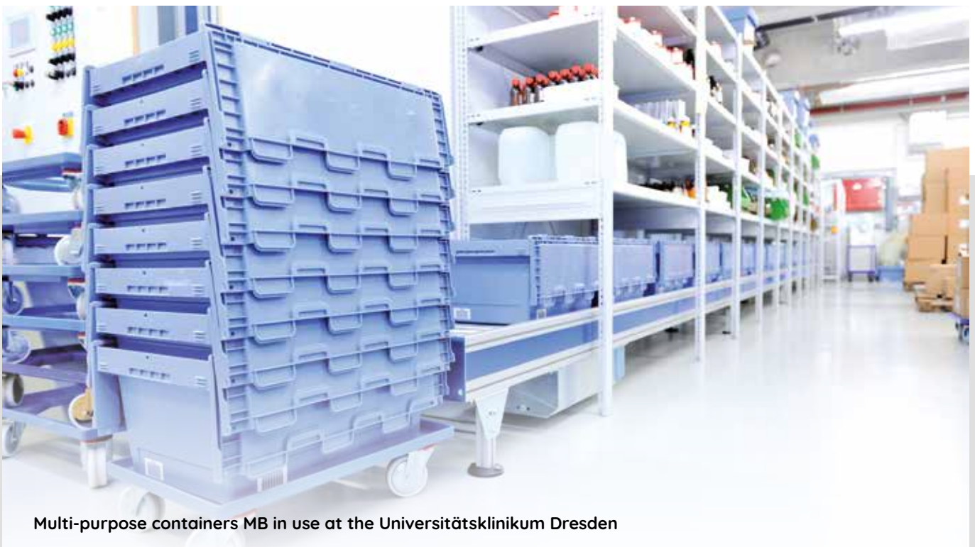
Multi-purpose containers MB in use at the Universitätsklinikum Dresden